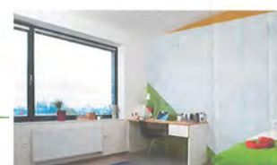
Large double room 40 m 2