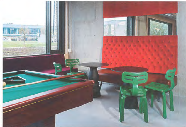
Domeq's chill-out zone has a pool table, a library, flat-screen TVs, a piano, bean bags, and much more