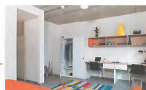
Apartment 36 m 2