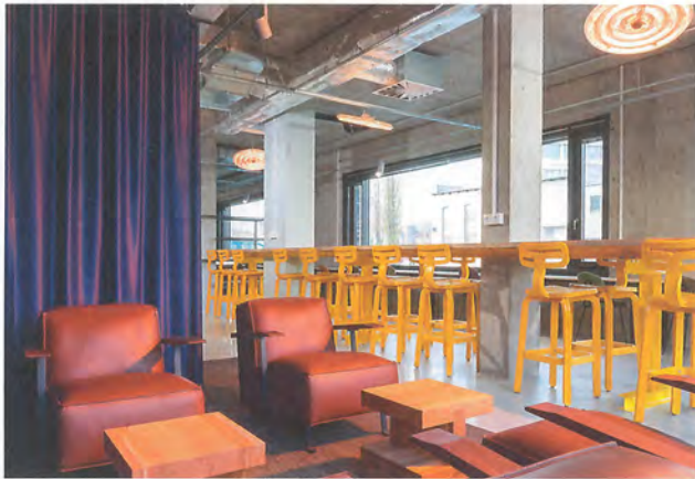
For focused one-on-one meetings Domeq has separated spaces that offer privacy and comfort for productive conversation

Moises Brazilian student living at Domeq for six months