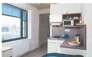
Single room 22 m 2

Brno, the Czech Republic's second largest city, is an amazing city full of young talented people and high-tech companies, and has a rich tradition of engineering. The city hosts 13 technical universities with over 3,000 graduates yearly. CTP tenants, such as Thermo Fisher, IBM, ABB and Avast, recognized this dynamic student population as a strong advantage to locate their operations here. According to FDI Magazine, second tier cities like Brno offer a better work-life balance, lower rents and house prices, and are void of the noise, pollution and traffic congestion found in the larger cities.