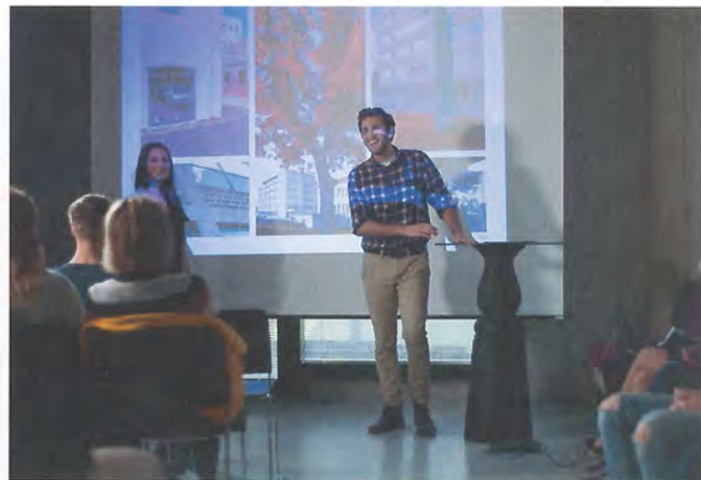
Domeq's fully-equipped presentation space is free for residents and ideal for community discussions