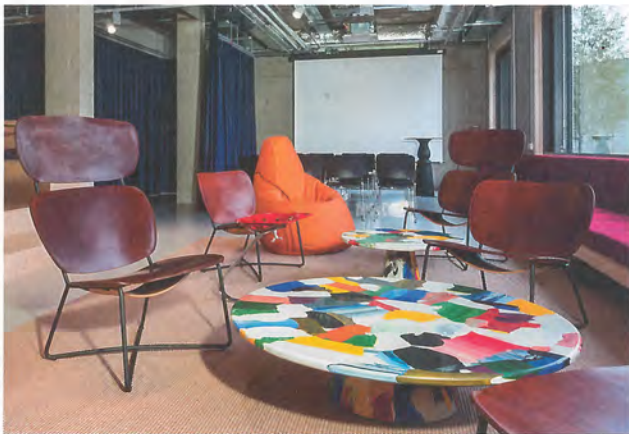
Collaborative areas include space for business presentations, networking, group cooking, or just websurfing on the high speed WiFi