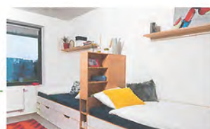
Double room 24 m 2